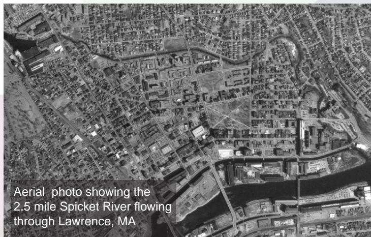
Aerial photo showing the 2.5 mile Spicket River flowing through Lawrence, MA

A former textile mill manufacturing city first incorporated in 1856, Lawrence, Massachusetts is a Gulf of Maine Watershed community located just north of Boston where the Merrimack, Shawsheen and Spicket Rivers converge. The Spicket originates in Salem, New