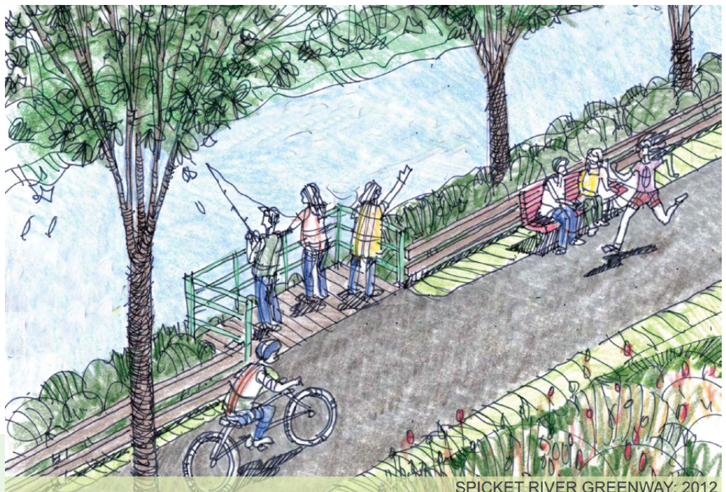
SPICKET RIVER GREENWAY, 2012

A $2.6 million Commonwealth's Gateway City Parks grant has provided the means to finalize the design and construction of the 2.5-mile Spicket River Greenway.