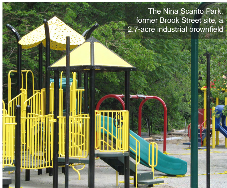
The Nina Scarito Park, former Brook Street site, a 2.7-acre industrial brownfield

In concert with the riverfront awareness and restoration efforts, several vacant lots and brownfields along the river have been transformed into open space, community parks and community gardens. The Dr. Nina Scarito Park (Scarito Park), named in honor of a local obstetrician, was the first brownfield-to-open space project completed in 2006. This neighborhood park