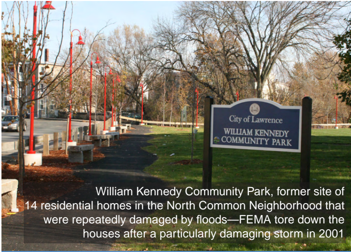
William Kennedy Community Park, former site of 14 residential homes in the North Common Neighborhood that were repeatedly damaged by floods—FEMA tore down the houses after a particularly damaging storm in 2001

“In this city, the park transformation is an important thing. There was so much joy in the neighborhood when the park opened—finally the children have a safe place to play!”