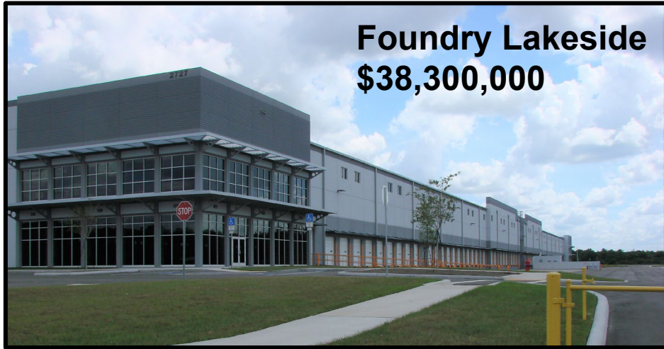
Foundry Lakeside $38,300,000