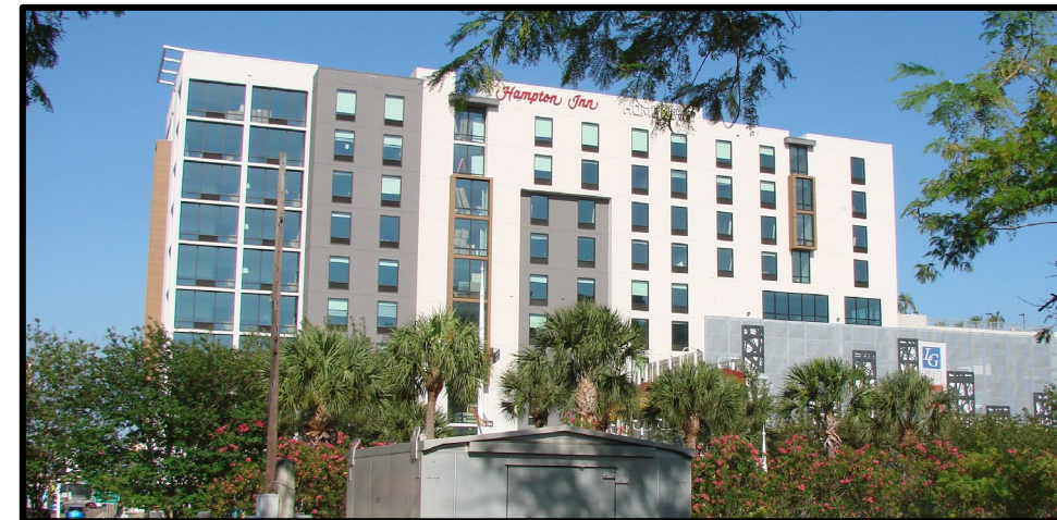
Hampton Inn $24,900,000