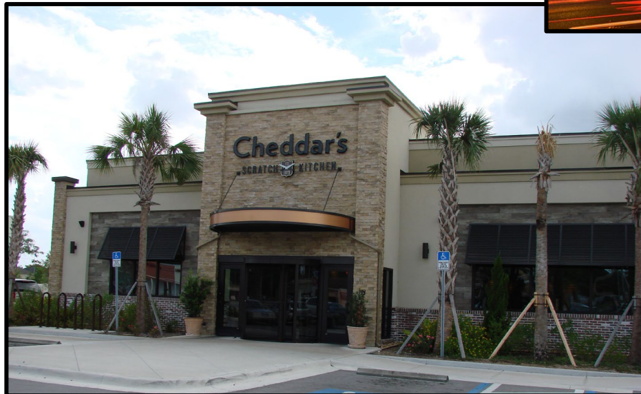
Former Hudson Nursery $7,000,000